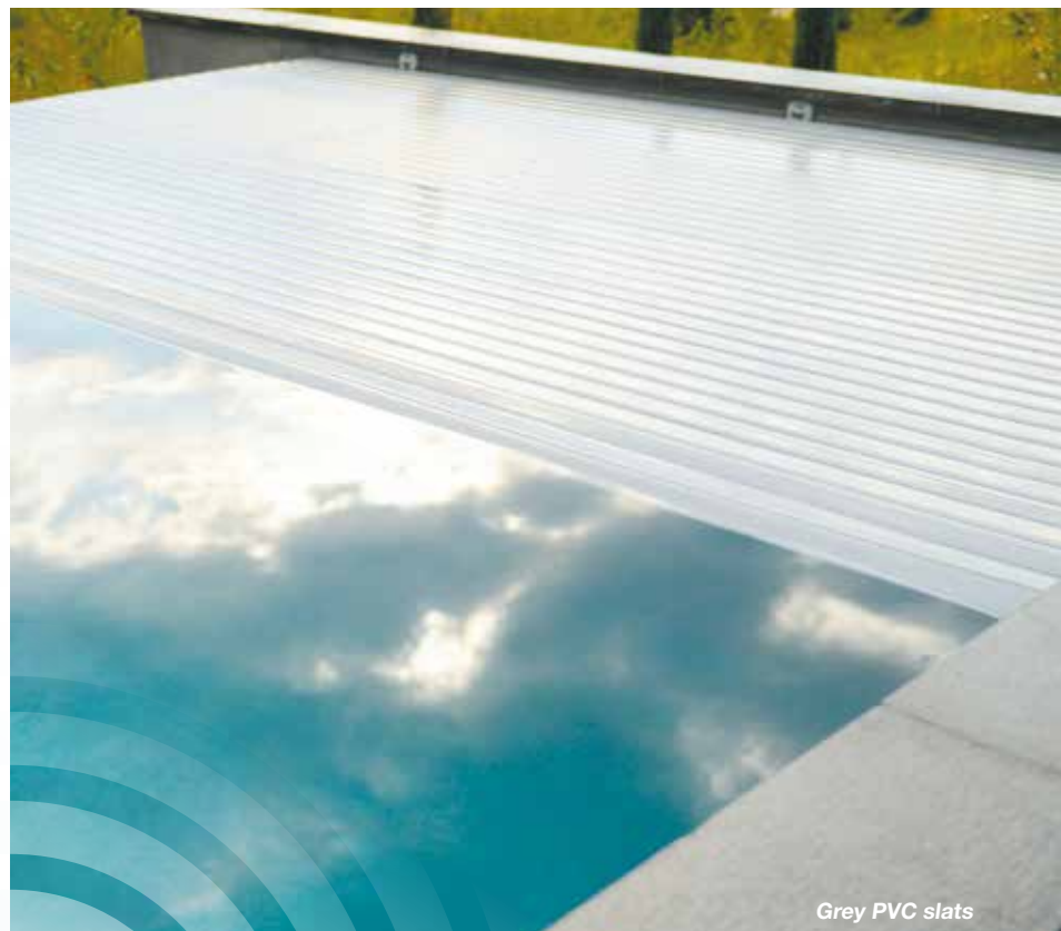
Grey PVC slats